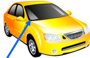
Sticker goes here on the inside of the windshield.

The parking permit must be affixed to the passenger side front lower corner of windshield of a registered vehicle. The sticker affixes to the inside of the windshield.